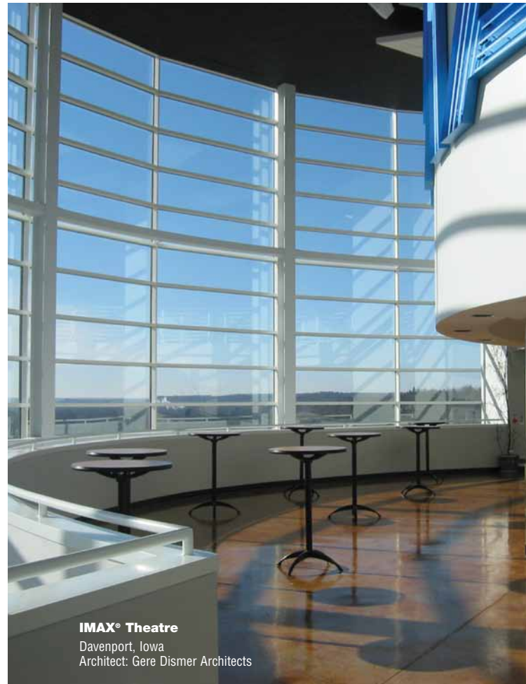
IMAX® Theatre Davenport, Iowa Architect: Gere Dismer Architects